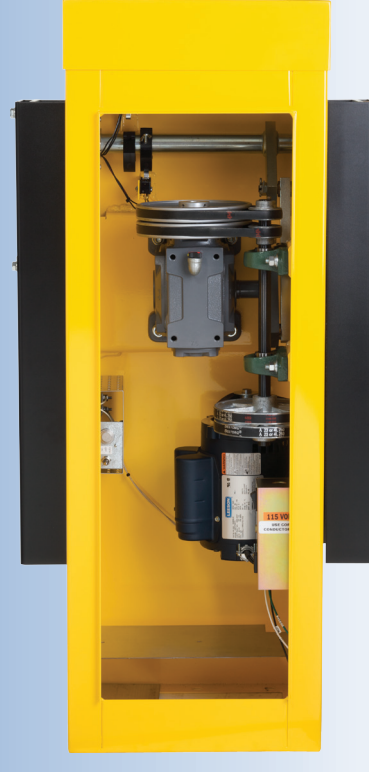
SG & SG-D

Wishbone style arm 16'-25' long 115 or 230 VAC