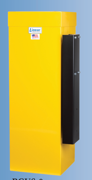
BGUS & BGUS-D Single arm 14'-18' 115 or 230 VAC