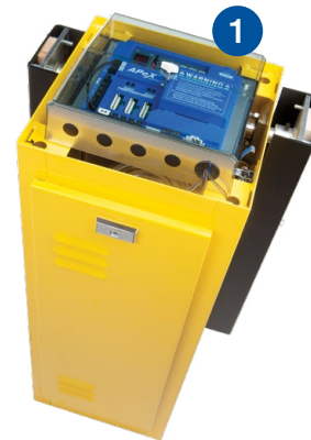
Model SG top view