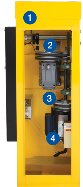
Model BGUS shown with optional thermostatically controlled heater