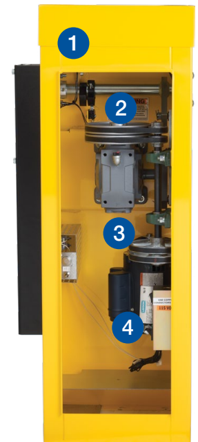
Model BGUS shown with optional thermostatically controlled heater