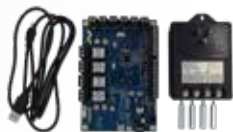
2-DOOR EXPANSION MODULES