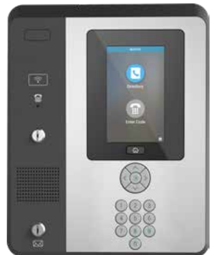
Entry Pro EP-736 PN: 720-200736

Property Managers choose Linear® Entry Pro for reliable value, low cost, and an embedded platform for telephone entry that offers all-weather reliability, easy management and scalability.